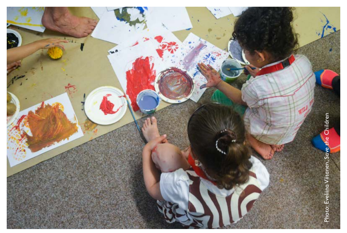
Painting provides the children with a way to express their thoughts and experiences and no words are needed.

There are different types of activities carried out in the CFSs in order to support children's holistic development, including creative, imaginative, physical, communicative and manipulative activities. Children are encouraged to paint, draw, sing, dance and engage in different physical activities (such as football) as well as to read books and tell stories, make puzzles and use building blocks.